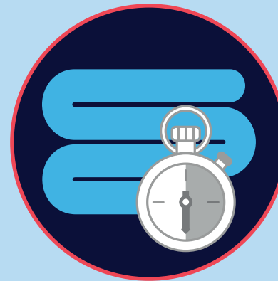
Ensure correct contact time