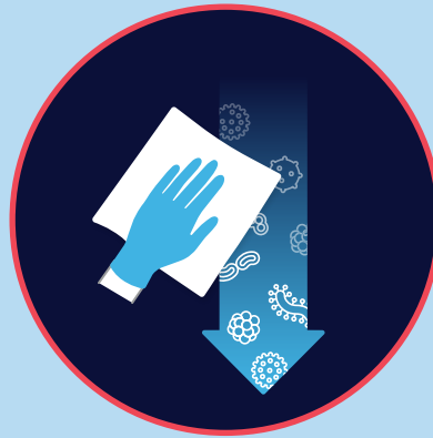
Wipe from clean to dirty