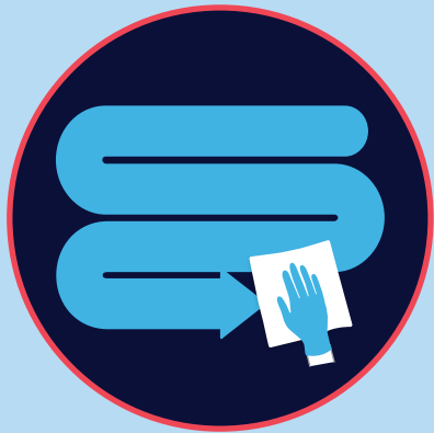
Wipe in an 'S' shaped pattern