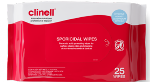
(Pack of 25 - CS25AUS)

If unsure please contact the Infection Prevention and Control Manager.