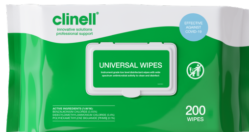
CW200AUS - Universal Wipes 200

Please dispose of in the waste bin provided.