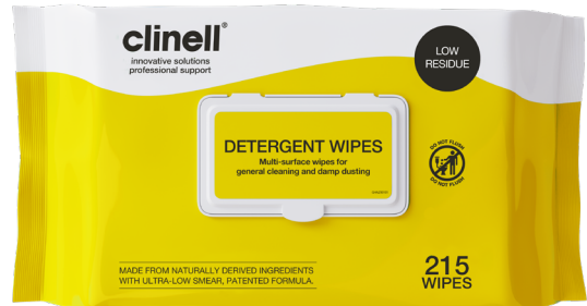
CDW215AUS - Detergent Wipes 215

Ensure lid is closed after each use to prevent wipes from drying out.